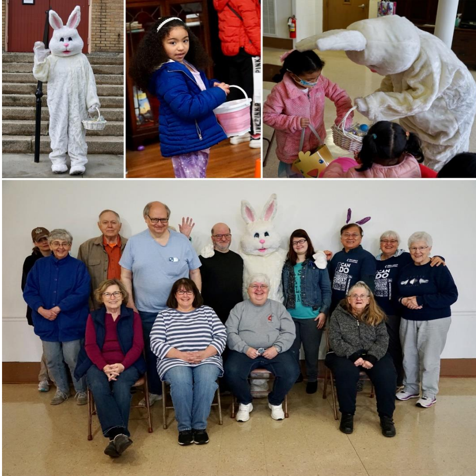
“Children’s Easter Craft & Egg Hunt” @ First & Wesley UMC, April 9, 2022