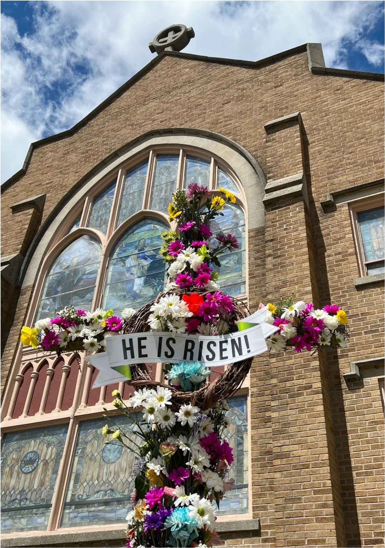
The Easter Cross on the First & Wesley UMC ground