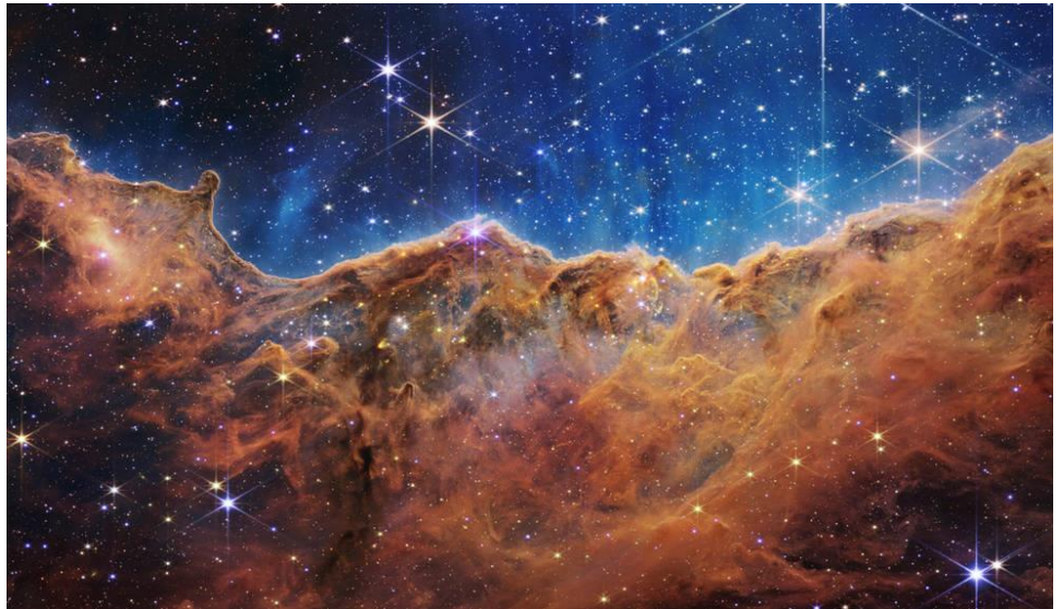
First Image from the James Webb Space Telescope